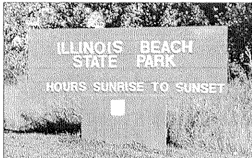
Illinois lawmakers are considering allowing state officials to charge visitors an annual or daily fee to enter state parks such as Illinois Beach State Park in Zion.